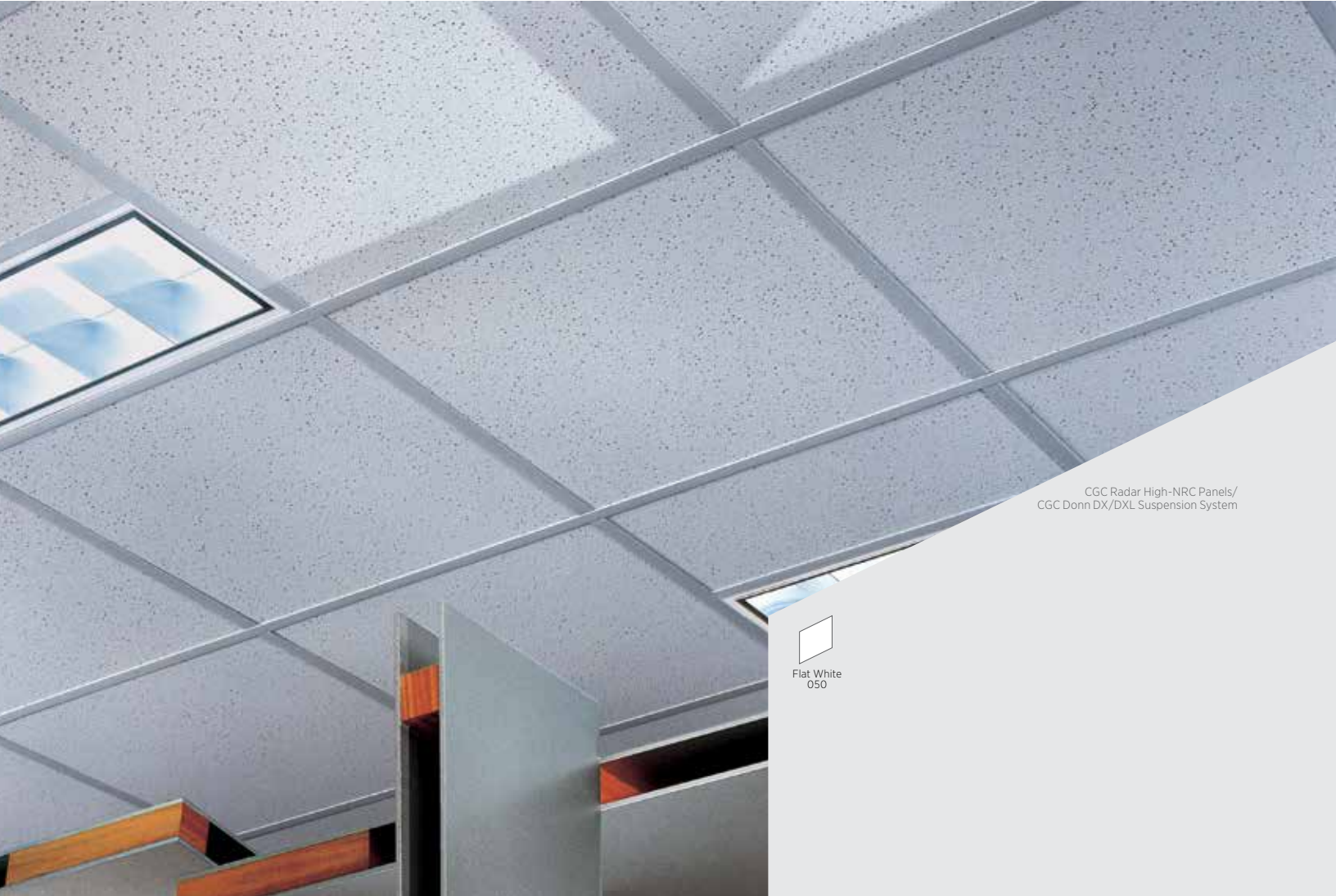
CGC Radar High-NRC Panels/ CGC Donn DX/DXL Suspension System