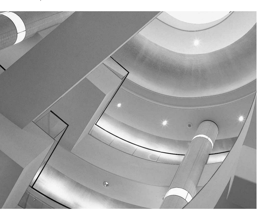
This drywall ceiling attractively houses the building's structural systems, mechanical and electrical services.

Abuse Resistance The variety of CGC products available allows for wall construction to be done with high abuse resistance relative to weight and cost. Specially manufactured gypsum and gypsum-fiber panels, combinations of gypsum panels and veneer plaster, and combinations of cement board and veneer plasters have added an entire new series of solutions to low-cost abuse-resistant systems.