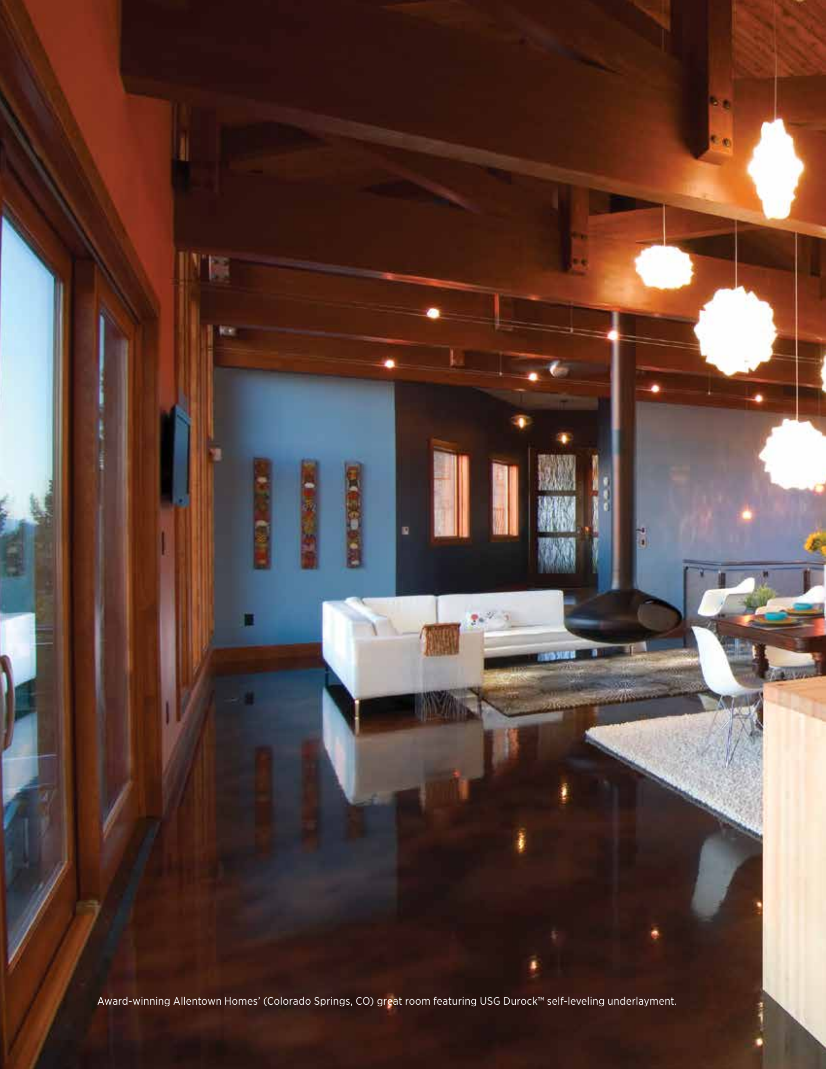
Award-winning Allentown Homes' (Colorado Springs, CO) great room featuring USG Durock™ self-leveling underlayment.