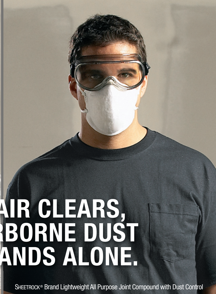
SHEETROCK® Brand Lightweight All Purpose Joint Compound with Dust Control