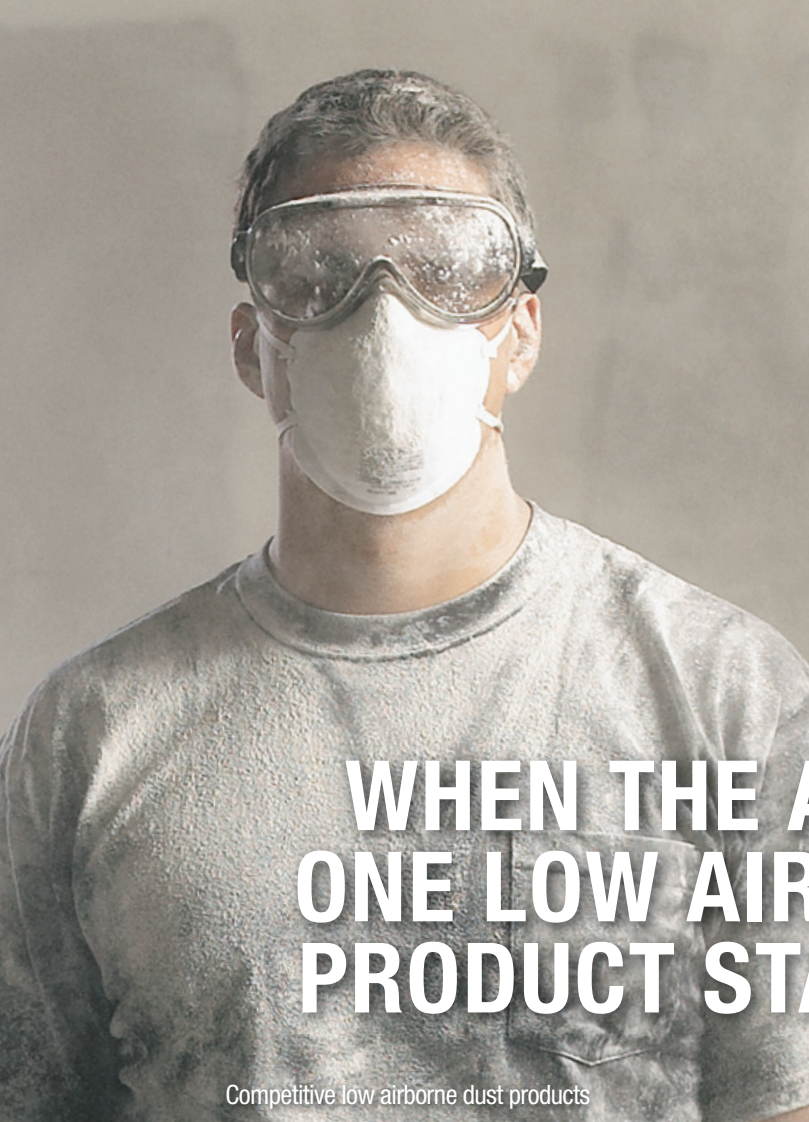
Competitive low airborne dust products